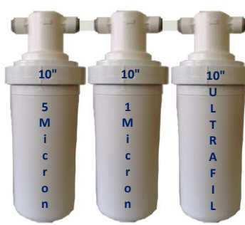
TRIPLEX 5µm, 1µm & UF in series