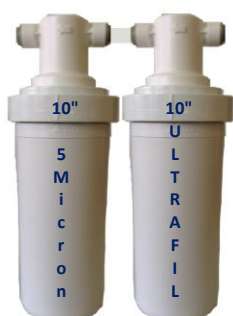
TWIN 5 µm & UF in series