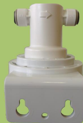
SPECIAL HEAD connection includes wall bracket