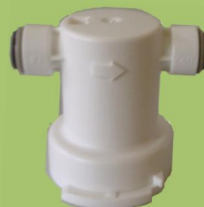
SPECIAL HEAD 3/8" inlet/outlet